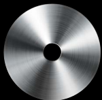
Deep Hole Drilling