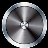
Precision Rollers & Shafts